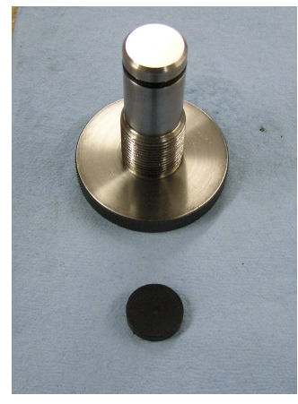
The black Ertalyte shim that quieted down the cam noise Continued on page 11