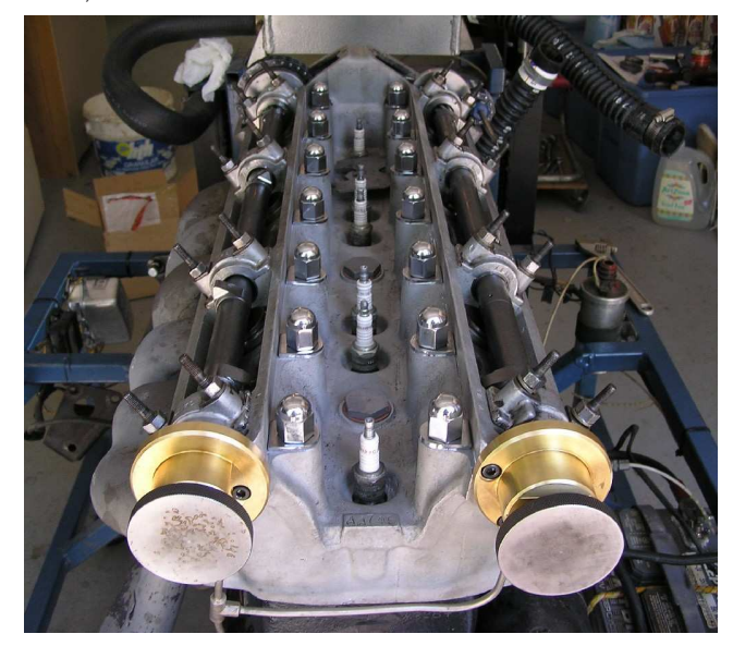
Variable Valve Timing head installed in the engine in the test stand

The VVT head is now being run at various constant RPM settings to "run in" the VVT parts. Barring any unforeseen problems, the head will be torn down after run in to check for wear on the VVT parts. Then it's off to the dyno for some test runs to develop advance curves for cam timing. So far, the VVT head is a success.