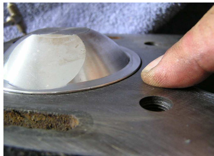
Above left Machining the VVT head Above right: Piston is above block in VVT motor, requires machining Bottom Mercer Runabout and the pits at the Stowe, Vermont slalom, Mt Mansfield in the background